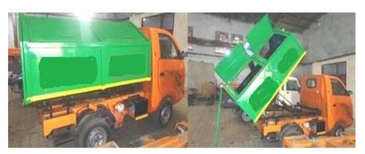
Proposed Vehicle Picture